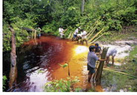
Preparar o Arumá